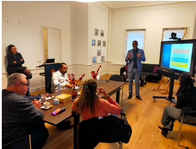
Picture: Honorable Minister Rene Violenus presenting to the members of the Sint Maarten Parliament

On December 7, The Minister Plenipotentiary welcomed several members of the Parliament (MP) of Sint Maarten to the Cabinet. During their visit he gave the MPs a presentation on the role and organizational structure of the Cabinet in The Hague. Moreover, a detailed outline of the various tasks of the Cabinet in the areas of Kingdom relations, EU affairs, diplomacy and economic, cultural and education policy was shared with the delegation from Sint Maarten. The most important aspects regarding the mandate of the Minister Plenipotentiary within the Kingdom Council of Ministers were also presented to the delegation.