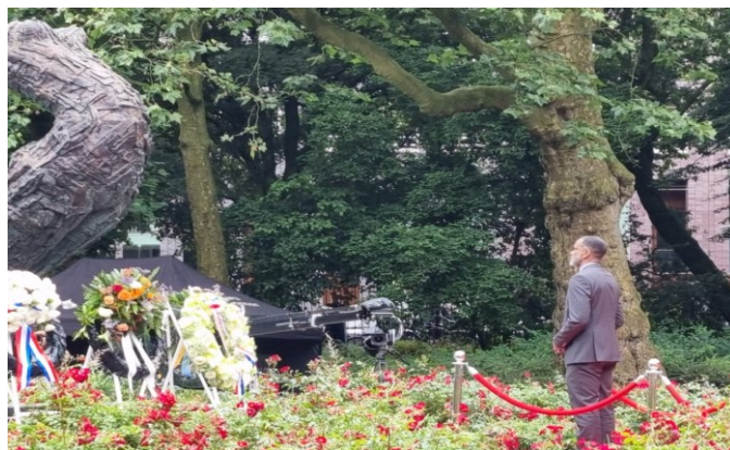
Picture: The Minister Plenipotentiary of Sint Maarten, Mr. Rene Violenus, in Amsterdam

The Minister Plenipotentiary of Sint Maarten along with the official representatives of other countries and organizations placed wreaths at the site of the monument of the enslaved in the Oosterpark in Amsterdam.