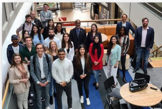
Caption: Minister Violenus, Ms. C. Voges, Ms. F. Telgt and some of the students following the minor Kingdom Affairs

A group of four students has been selected to focus on an assignment developed by the Cabinet of the Minister Plenipotentiary related to Sint Maarten. They will be conducting research into the effect that media has on the relationship between The Netherlands and Sint Maarten. Based on this, they will develop a media strategy in which Sint Maarten, despite the existing democratic deficit, can position itself in an equitable manner.