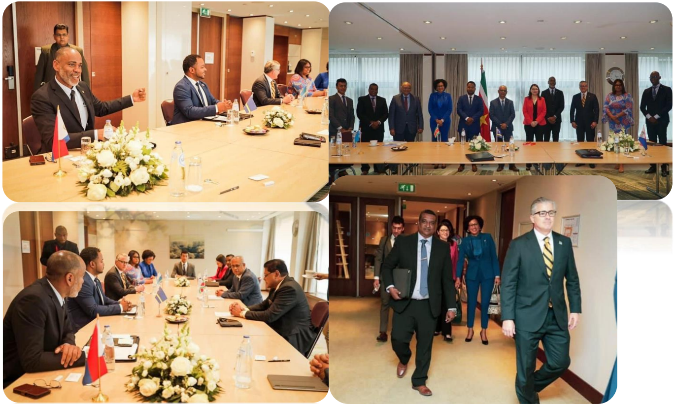
Picture: An impression of the meeting at Hilton Hotel Den Haag with the Surinamese Delegation