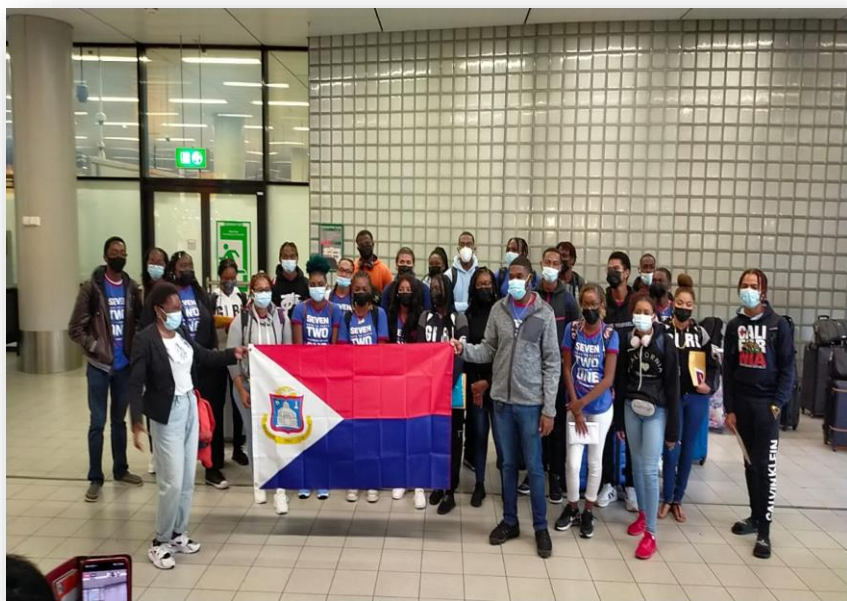
Picture: students arriving at Schiphol airport

"You have all taken the courageous first step...the metaphorical shore will always be there, safe and unchanged. Don't let the uncertainty of the journey, fear or doubt limit you, embrace it all. Only by doing so will you be able to achieve greatness."