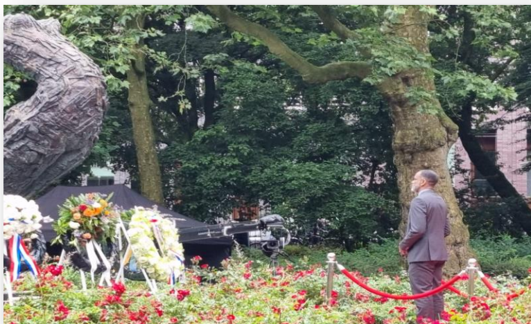
Picture: The Minister Plenipotentiary of Sint Maarten, Mr. Rene Violenus in Amsterdam

The Minister Plenipotentiary of Sint Maarten along with the official representatives of other countries and organizations placed wreaths at the site of the monument of the enslaved in the Oosterpark in Amsterdam.